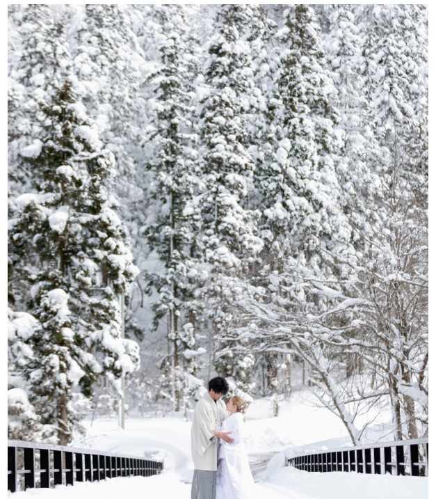
Snowy wedding photo shoot