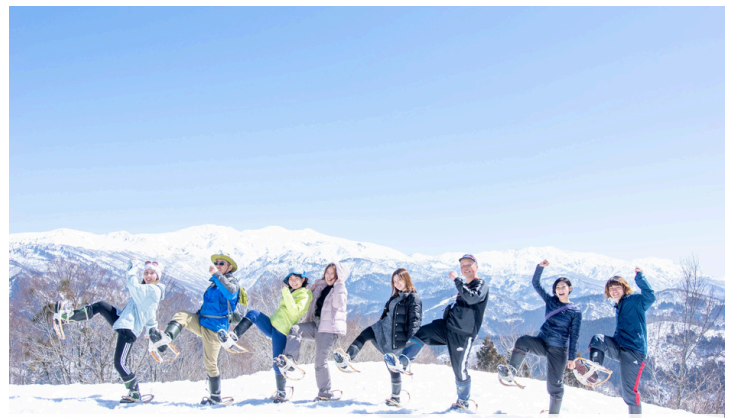
Hike with Kanjiki snowshoes