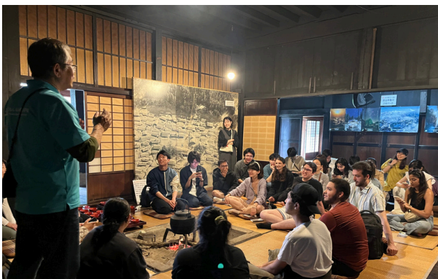
SDG's Program for students