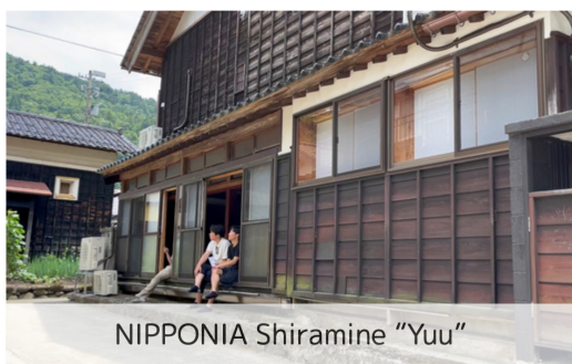
NIPPONIA Shiramine "Yuu"