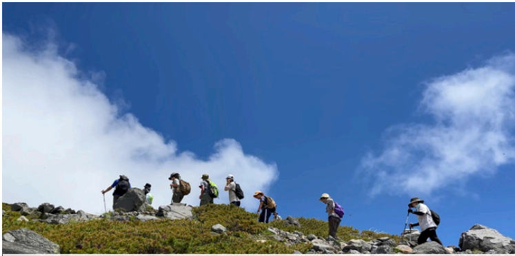
Sacred mountain Hakusan trekking (2,702m)