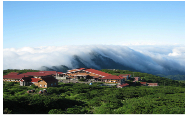
Hakusan Mountain lodge (2,400m)