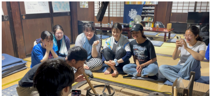
Traditional lifestyle experience