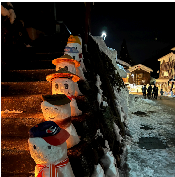
The town is full of snowmen! Snowman Festival in Feb.