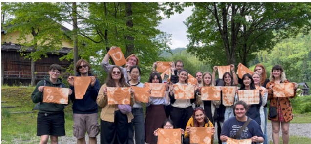
Dyeing workshop creating truly unique pieces