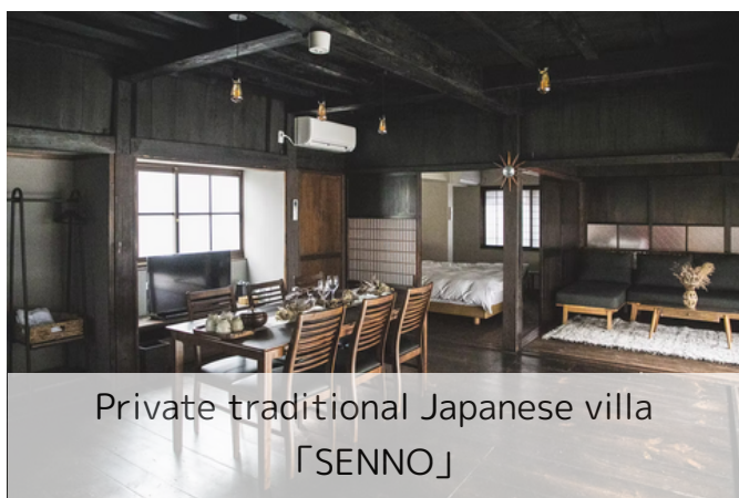
Private traditional Japanese villa 「SENNO」