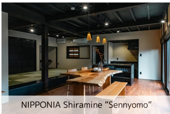
NIPPONIA Shiramine "Sennyomo"