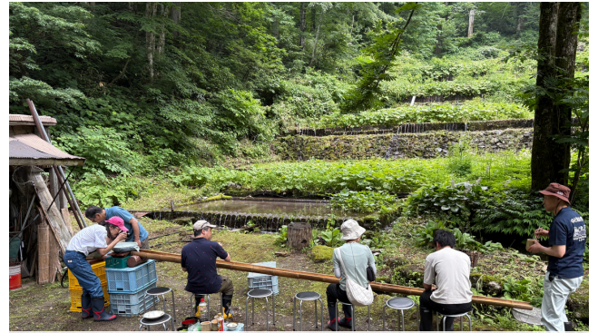
Flowing somen noodles with fresh wasabi.