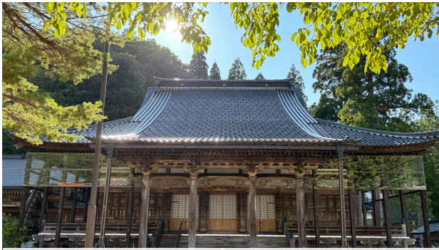
Rinseiji Temple, housing the sacred statues brought down from Mount Hakusan