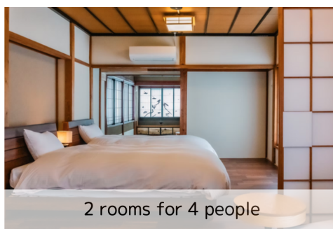
2 rooms for 4 people