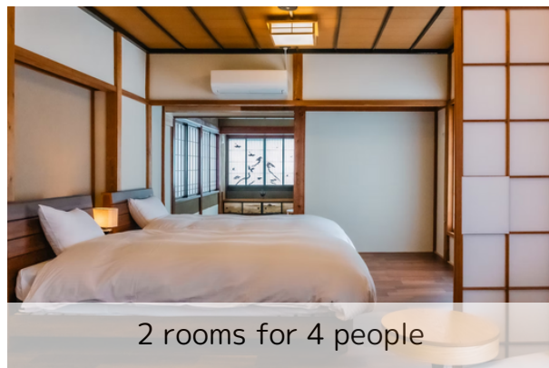
2 rooms for 4 people