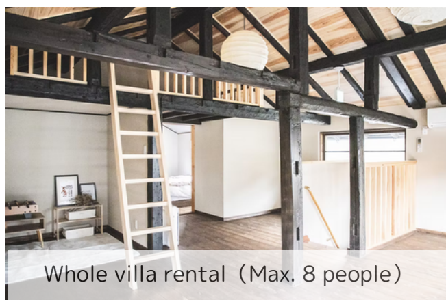
Whole villa rental (Max. 8 people)