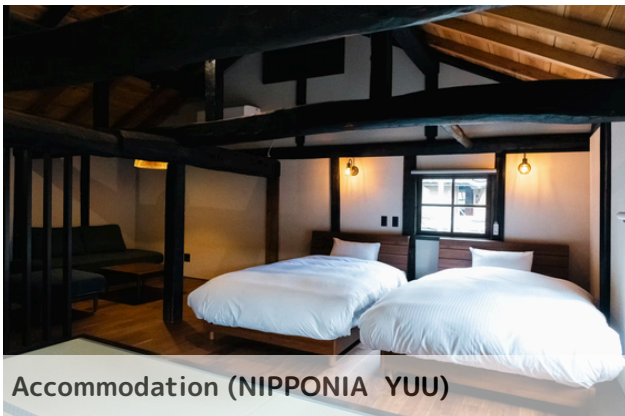
Accommodation (NIPPONIA YUU)

This association brings together local stakeholders in lodging, food, experience-based tourism, and regional development. It develops and promotes unique mountain life programs (similar to "Countryside stay" in other regions), making full use of Shiramine's rich natural and cultural assets. In 2022, the council became home to YOSITAI Inc., a cross-sector corporation founded by local entrepreneurs and researchers aiming to revitalize the area through sustainable tourism and regional collaboration. YOSITAI now serves as the association's core organization.