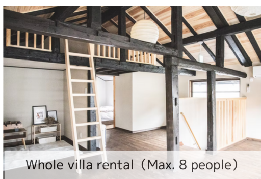
Whole villa rental (Max. 8 people)