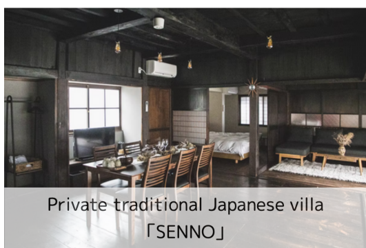
Private traditional Japanese villa 「SENNO」