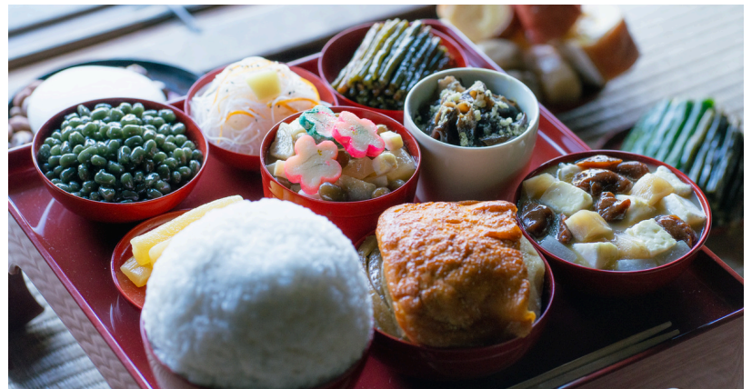
Festive meal for the important temple event, Hōonkō (Memorial Service of Gratitude)