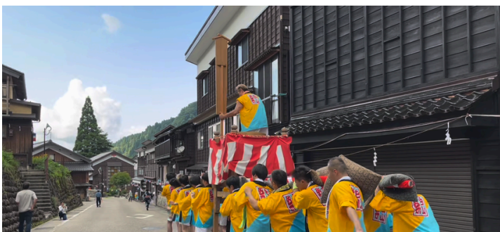
Join in Hakusan Festival