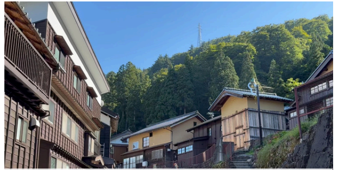
Important Preservation Districts for Groups of Traditional Buildings