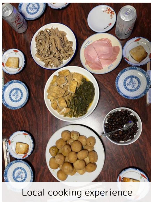
Local cooking experience