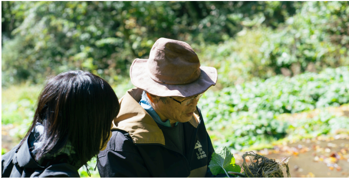
Wasabi harvesting experience at a traditional wasabi farm near the headwaters.