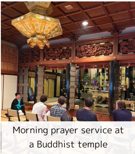
Morning prayer service at a Buddhist temple