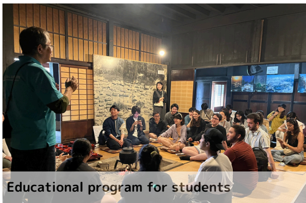
Educational program for students