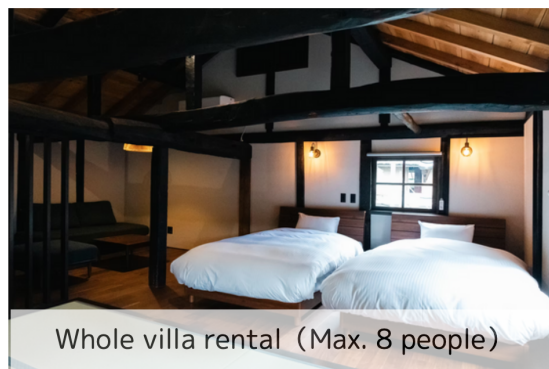
Whole villa rental (Max. 8 people)