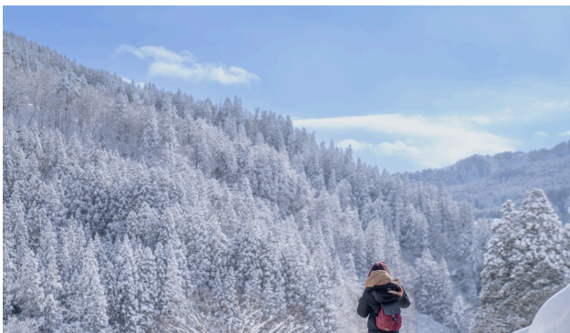
Winter scenery with heavy snowfall sometimes reaching up to 4 meters.