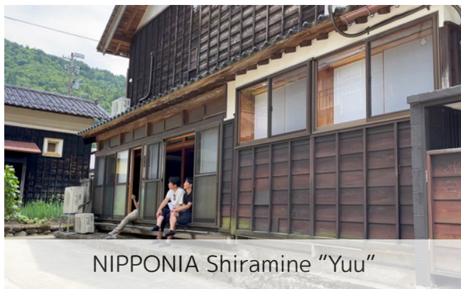
NIPPONIA Shiramine "Yuu"