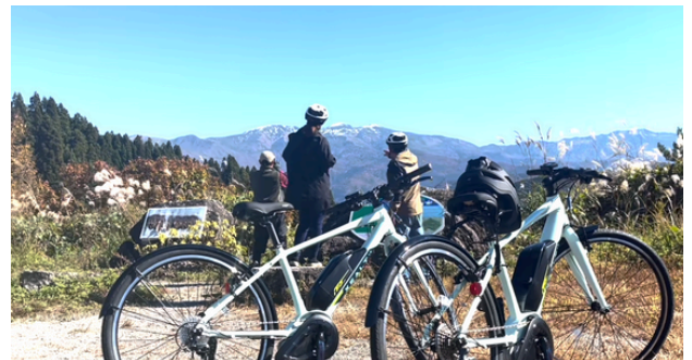
E-Bike Nature cycling