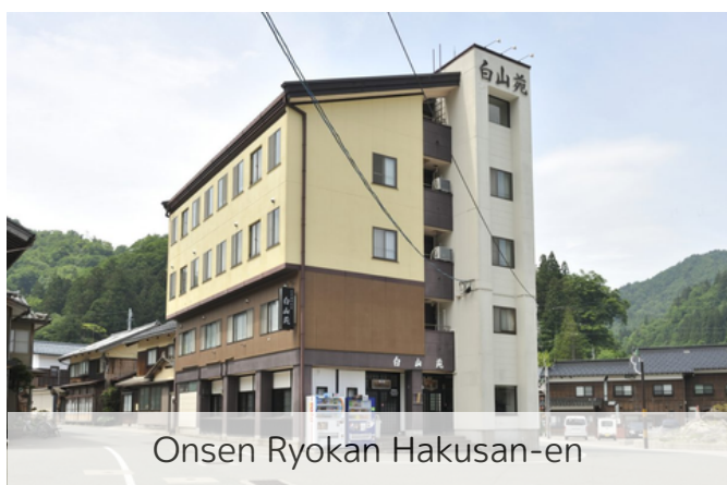
Onsen Ryokan Hakusan-en