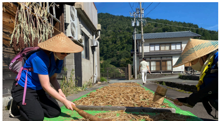
Traditional agriculture experience