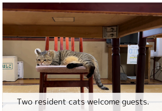
Two resident cats welcome guests.